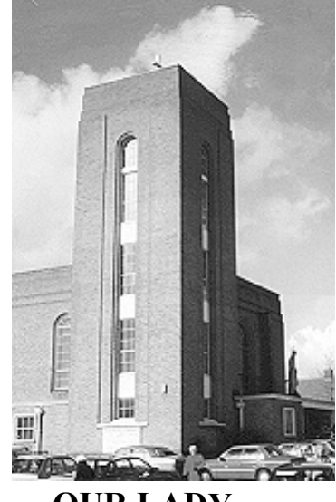
OUR LADY, QUEEN OF APOSTLES